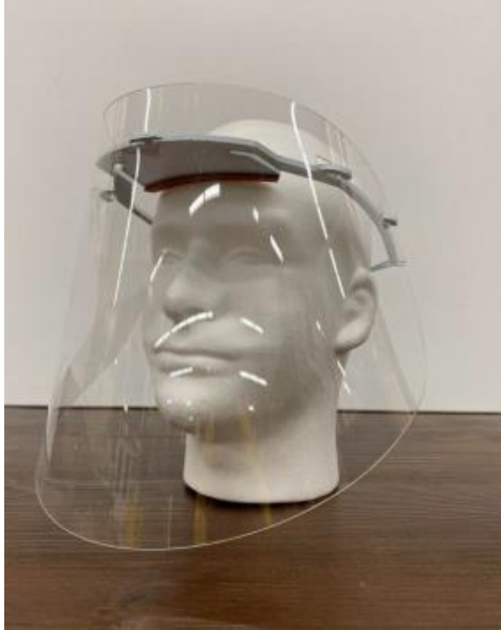
Fig. 1: Fully assembled shield